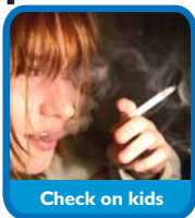
Check on kids